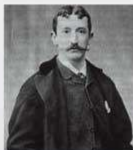
Carl Koller, 1857 - 1944

Koller worked at the University Hospital of Vienna after his medical studies. At the suggestion of Sigmund Freud, Koller discovered that a few drops of cocaine solution eliminated the problems of eye reflexes. Koller is therefore considered the founder of local anesthesia in ophthalmology.